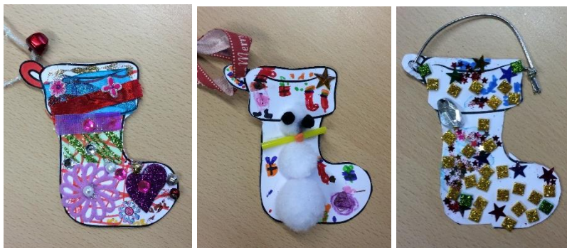
Above: Year 1 Winners - left to right, Badgers, Deer and Foxes