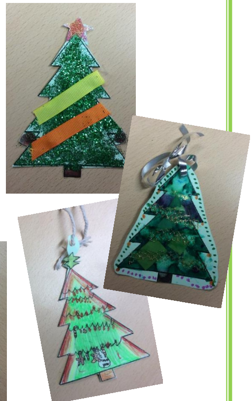
Above: Year 2 Winners - top to bottom, Woodpeckers, Owls and Ducks