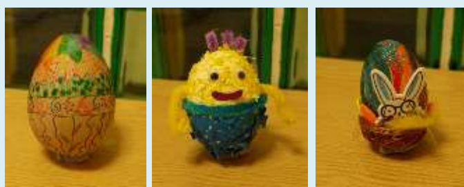
Above: Left to right, Moles, Rabbits and Hedgehogs