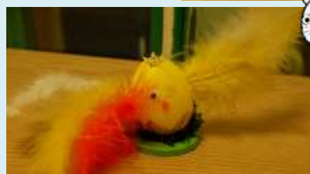
Above: Left and right Woodpeckers and Owls, Ducks (bottom)