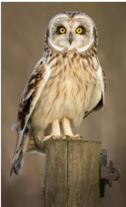
Short Eared Owl