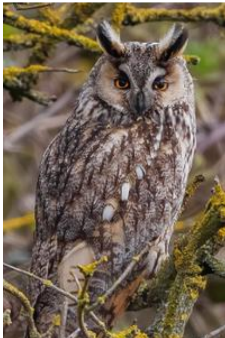
Long Eared Owl