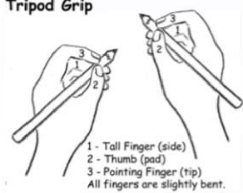
Visual of Pencil Grip Left-Handed